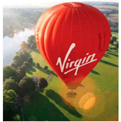
Virgin Hot Air Balloons