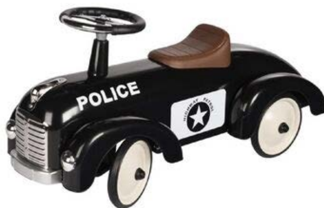
Not on the High Street